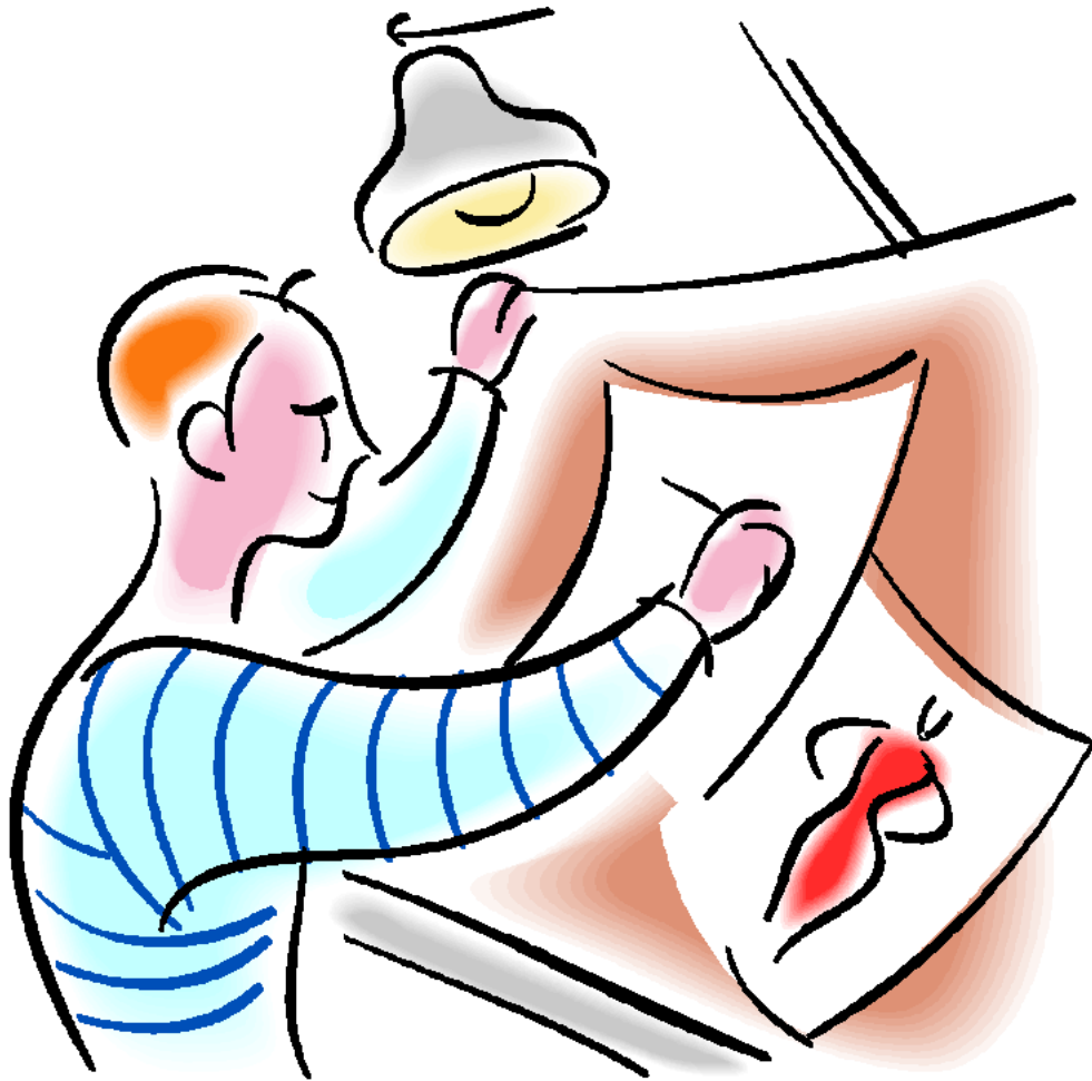
Fashion Designer Disinjatur tal-Moda