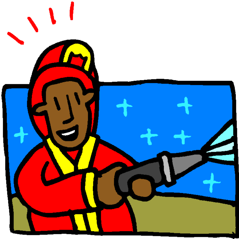
Firefighter Haddiem tat-Tifi tan-Nar