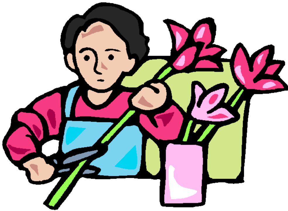
Florist Bejjiegħ tal-fjuri