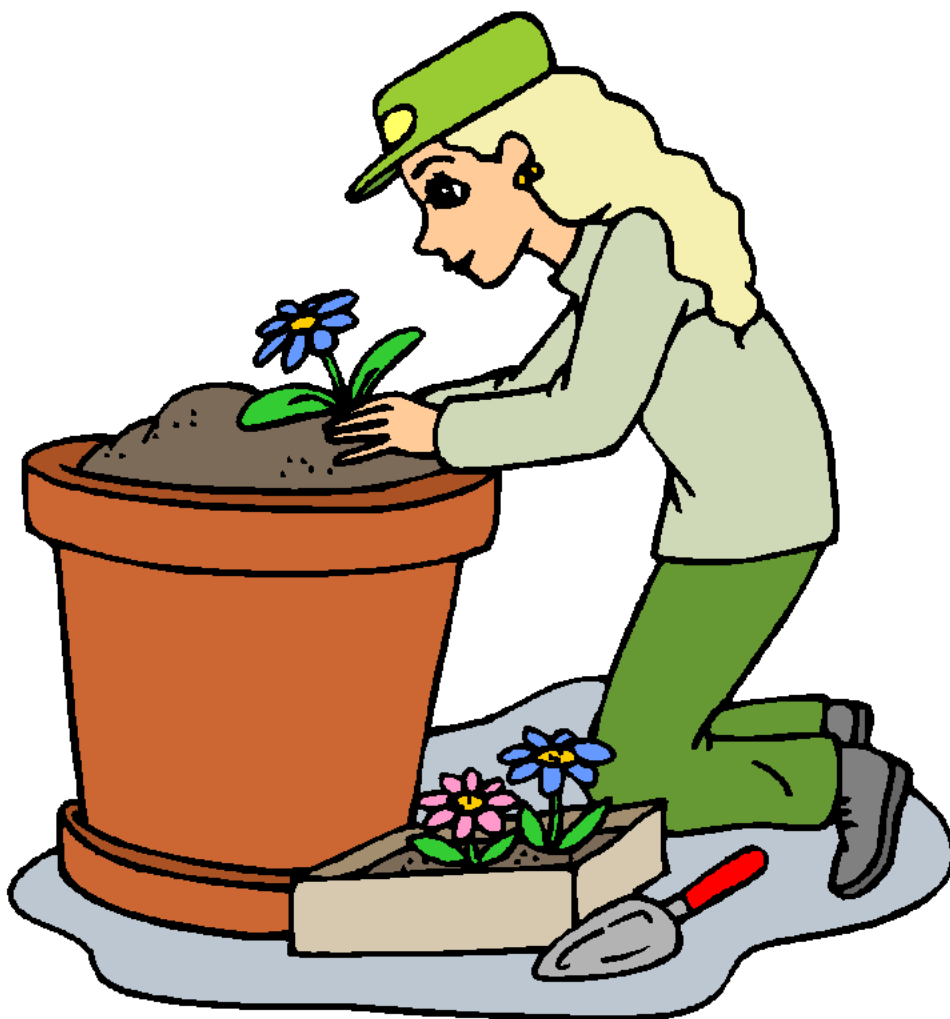
Gardener Beer Hagaajiye