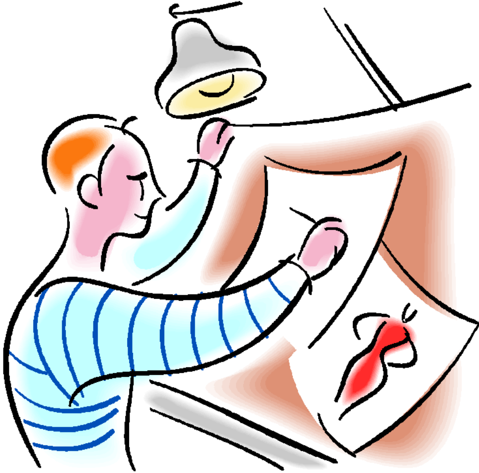
Fashion Designer Naqshadeynta Dharka