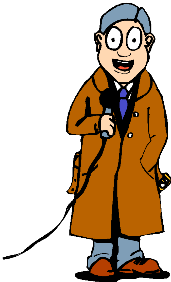
News Reporter War-tebiyaha